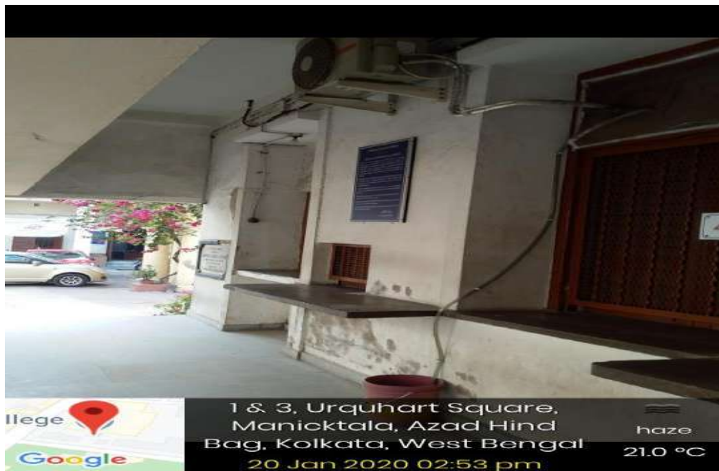
Collection from water dripping from air conditioner