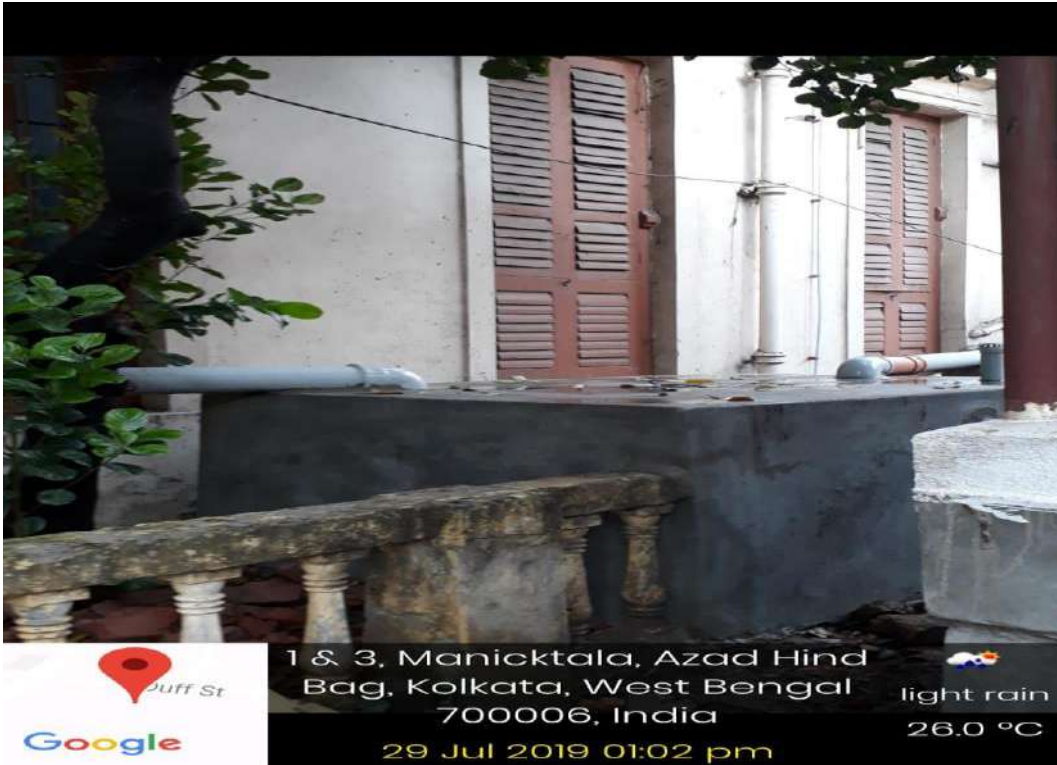
Construction of tanks