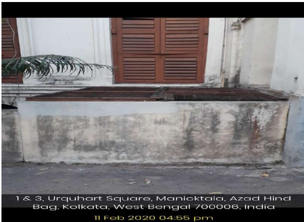
Maintenance of tanks with aquatic plants and guppy fish