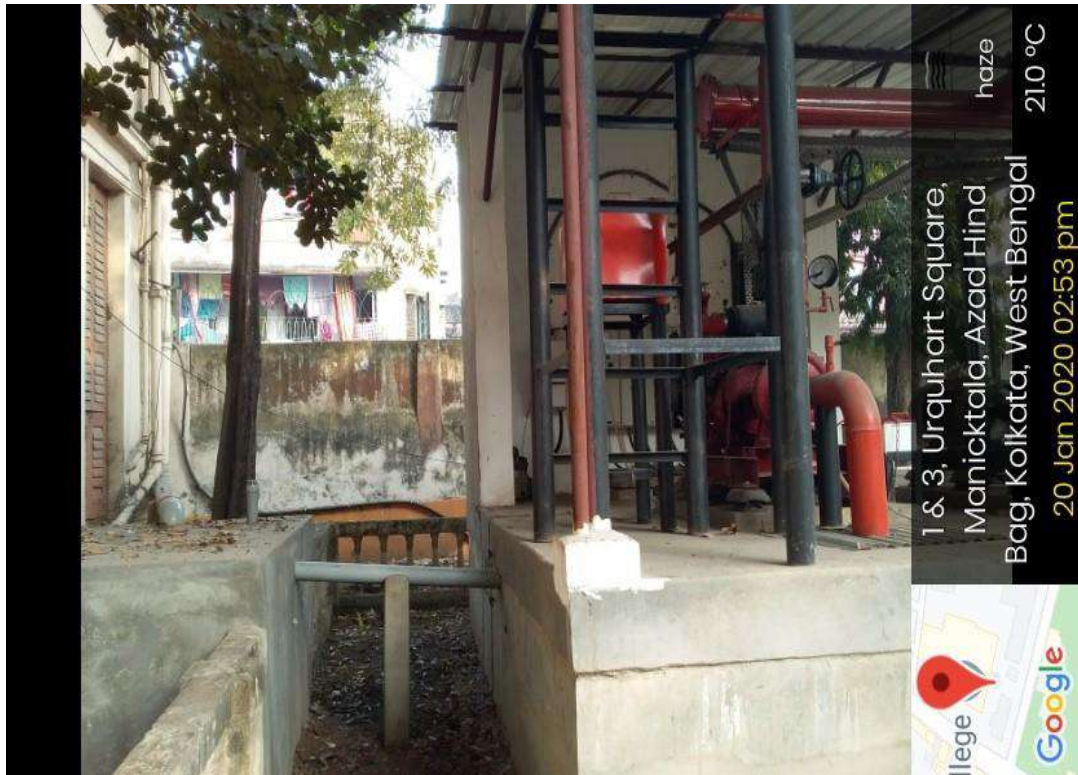
Rain water harvesting by construction of reservoir